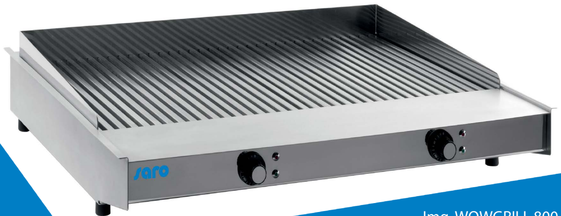
Img. WOWGRILL 800

WOW GRILL MINI (444-1000) WOW GRILL 400 (444-1005) WOW GRILL 800 (444-1010) WOW GRILL 1200 (444-1015)